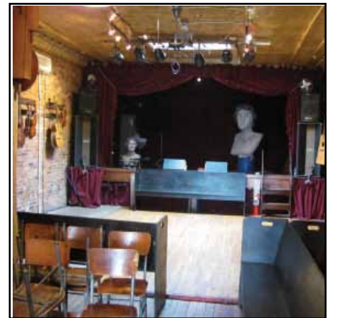
Above is the Jalopy stage where exceptional music is presented nightly. Below is a sampling of the vintage instruments for sale.

The Jalopy Theater and School of Music is located at 315 Columbia Street and is open every day but Tuesday and have a very snazzy website at www.jalopy.biz